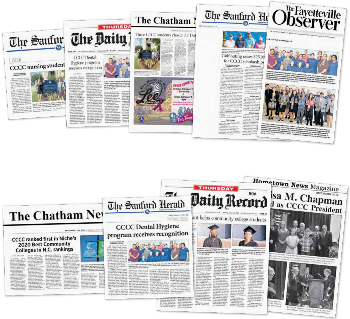
Media coverage on all aspects of the college (stories written internally)

Promoted the college and its offerings through print and online methods