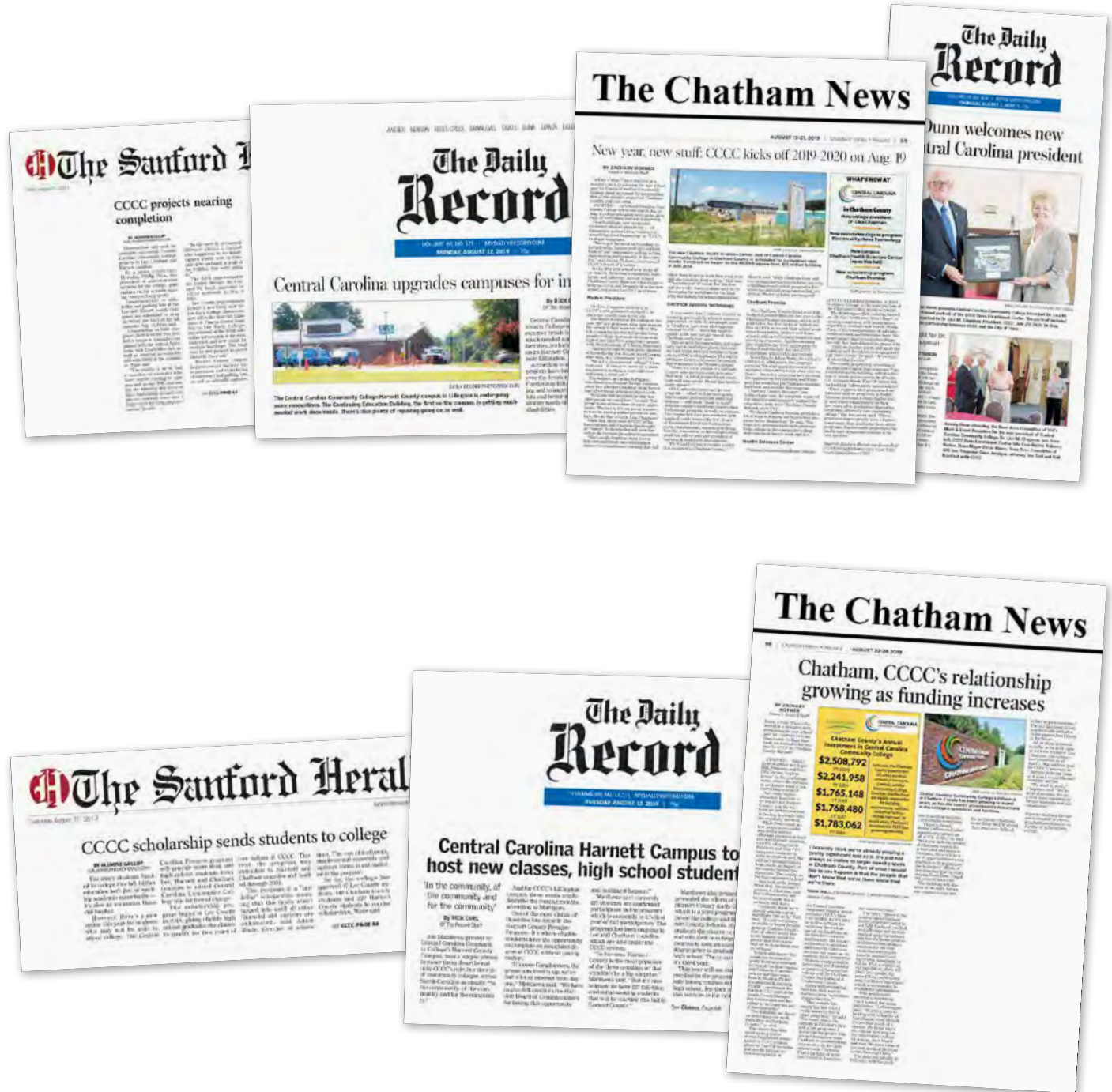
Media coverage on all aspects of the college (stories written externally)